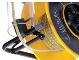
Figure 3 Hanger to support the meter at the well head. Tape Guide to protect the tape from sharp edges.