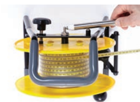
Figure 2 To Test the Entire System: Make sure sensitivity dial is turned fully clockwise. Touch the probe body to the standoff screw and probe tip to the stud (on axle) at the same time. The buzzer will sound if the system is okay.