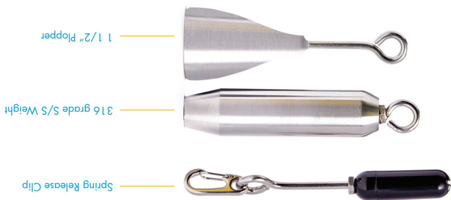
Figure 1 Spring Release System with accessories