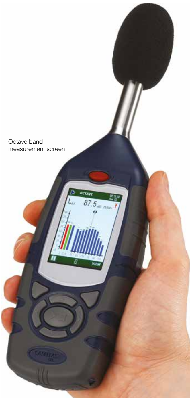
Octave band measurement screen

Different models are available depending on your requirements for use in general workplace noise measurements, up to full industrial hygiene requirements where octave band analysis is required for the effective selection of hearing protection.