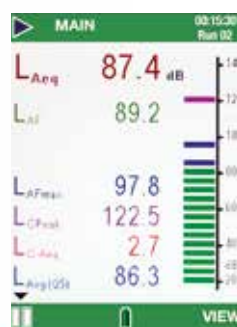
Broadband measurement screen

Measured parameters are displayed in different colours, and the bar graphs are illustrated with the same colours to give an easy understanding of the noise climate.