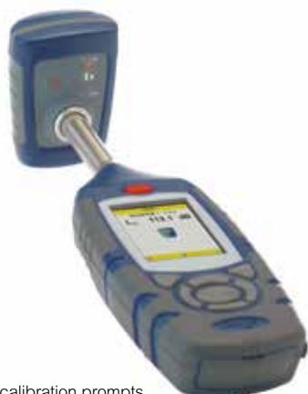
Automatic calibration prompts you to select the calibration routine